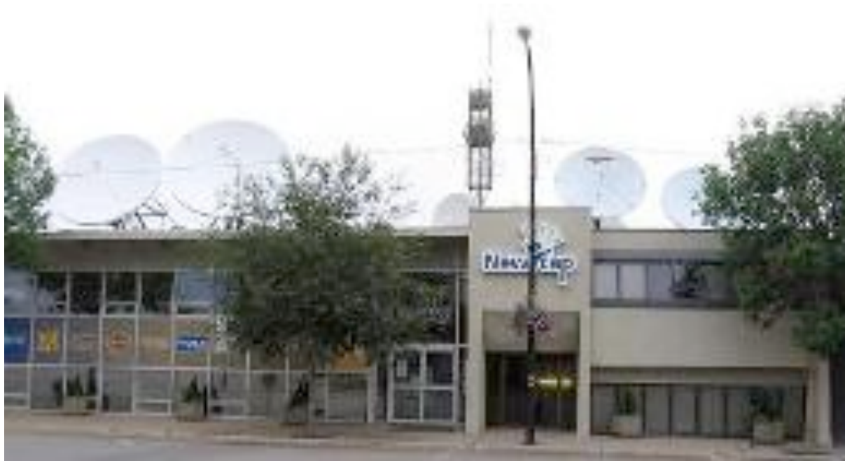
NewCap Broadcasting Company